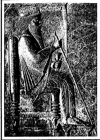
A stone depiction of Darius the Great, ruler of the Persian Empire when the Persian Wars began in the 490s BCE.

The Persian Wars were a defining moment in Greek history. The Athenians, who would dominate Greece culturally and politically through the fifth century BCE., regarded the wars against Persia as their greatest and most defining moment.